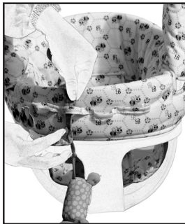
7 Attach portable toys* to front or back loops to keep them close and fastened while swinging (*toys not included).