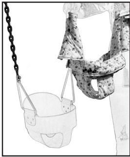
1 Align Swing 'n Smart seat cover with leg openings of bucket-style swing facing forward.