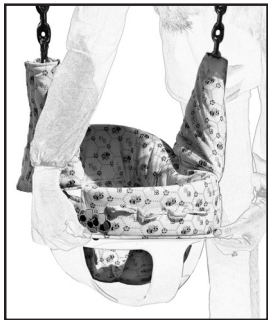
6 Adjust fit with Velcro-like fasteners to provide soft padding and protection for infant.