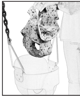
2 Set Swing 'n Smart seat cover into bucket-style playground swing with chain guards and adjustment fasteners all in open positions.