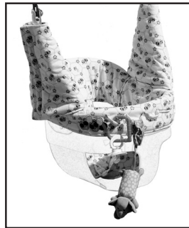
8 The finished product should look like above revealing the bumble bees applique to the front side of the swing.