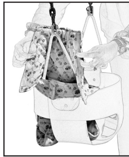
3 Wrap both sides of the Swing 'n Smart padded chain with chain guards and adjustment fasteners all in open positions.